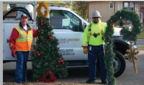
Hanging holiday decorations in Edwardsville