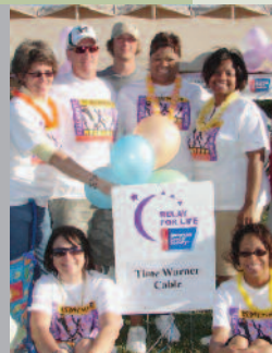
Joining Relay for Life in Kearney and Kansas City