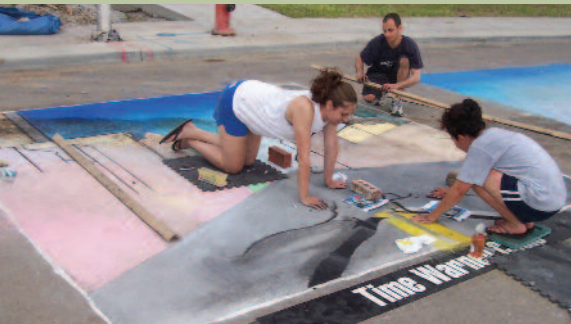
Supporting KC Chalk & Walk Festival in the Crossroads District