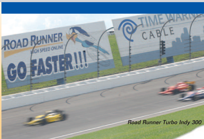
Road Runner Turbo Indy 300

"People seldom take the time to communicate when service is excellent, so I want to be sure you are aware of this tech's wonderful focus on customer service."