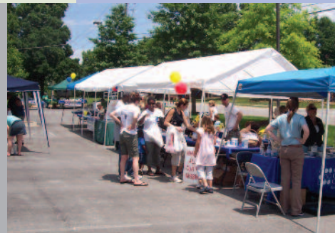
Helping at Kids Day America in Shawnee