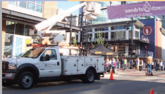
Hanging March of Dimes March for Babies banner in Downtown Kansas City