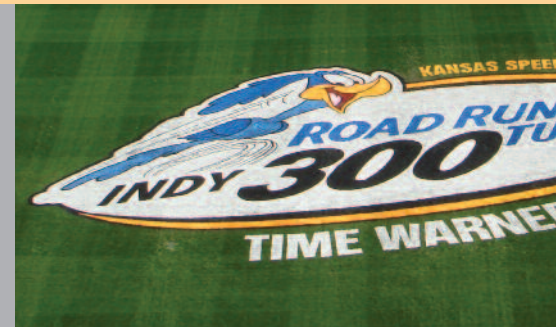
Sponsoring Road Runner Turbo Indy 300 at Kansas Speedway