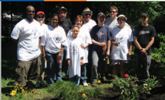
Sprucing up a Midtown safe house with United Way Day of Caring