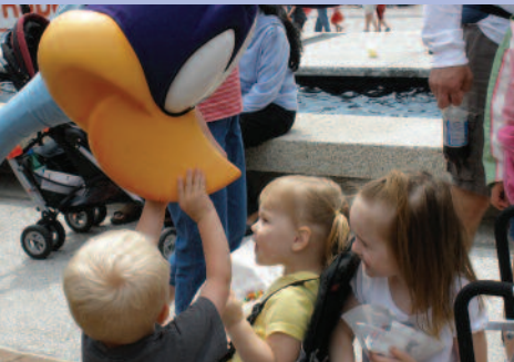
Entertaining Jiggle Jam crowds at Crown Center