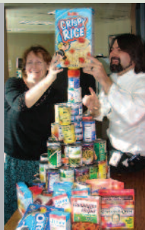
Feeding the hungry through Harvesters