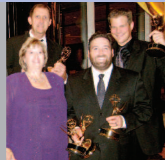
Winning a record seven Emmy Awards for Metro Sports

"I had believed customer service was not what it used to be, but your Call Center rep gave me confidence that great customer service has returned."