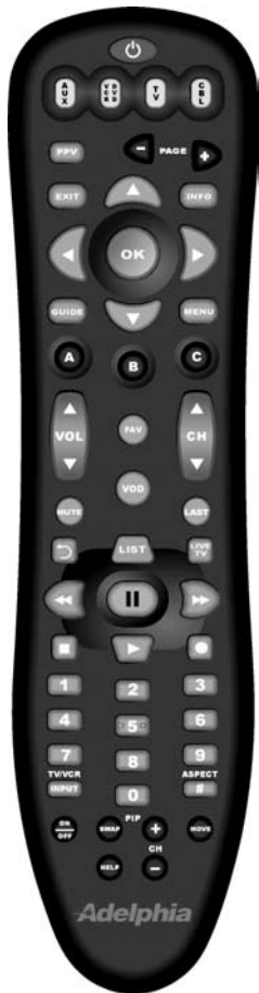
© 2005 ICX Global, Inc. All rights reserved Part Number ICX 18351, version 2.0 02102005