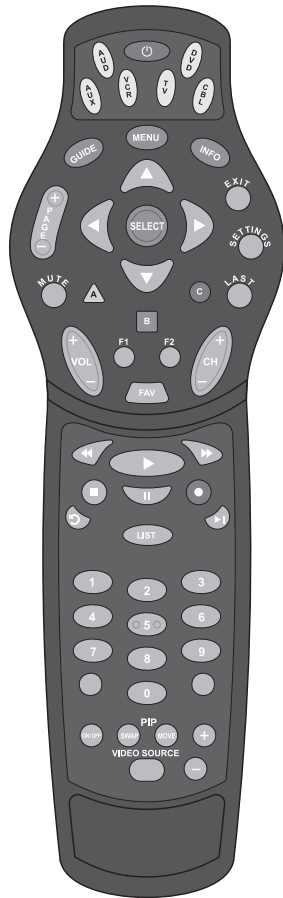
© 2003 US Electronics, LLC All rights reserved Part Number USE 18268, version 1.0 05202003

VISIT US ON THE WEB YOU CAN FIND PROGRAMMING INSTRUCTIONS AND CODES FOR ALL OF OUR REMOTE CONTROLS, AS WELL AS INFORMATION ABOUT OUR OTHER PRODUCTS ON OUR WEBSITE: www.uselectronics.com